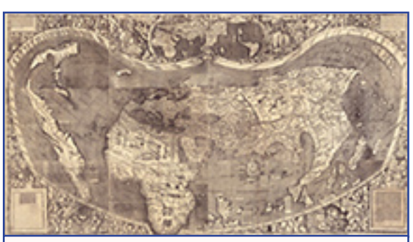
The 1507 Waldseemüller Map, Library of Congress Geography and Map Division Washington, DC

Collections at the Library of Congress consist not only of material objects but also of digital files. In some cases, material objects are scanned, which creates a digital copy.