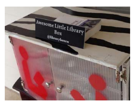
An Awesome Little Library Box.

Read \underline{\text{more}} about LAMs activities at SXSW.