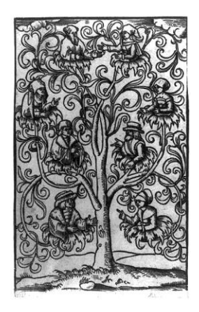
<u>Family tree</u>.

As explained in the <u>Preserving Email report</u> (PDF) from the Digital Preservation Coalition, the exchange of email messages is reliant on sustained interoperability so standardization is essential. Now, let's explore what we've documented so far of the <u>email file format</u> <u>family tree</u>.