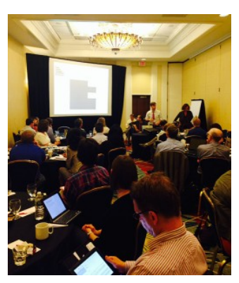
Breakout session at Digital Preservation 2014.

Digital Preservation 2014, held July 22-24, marked the 13th major meeting hosted by NDIIPP in support of the broad community of digital preservation practitioners, and it was certainly the largest, if not the best. This meeting has rapidly evolved to welcome an ever-expanding group of practitioners, ranging from students to policy-makers to computer scientists to academic researchers.