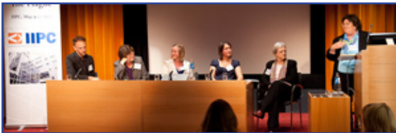
Session panel at the 2011 IIPC GA.