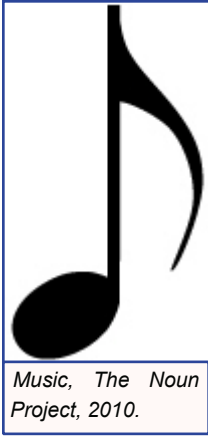
Music, The Noun Project, 2010.