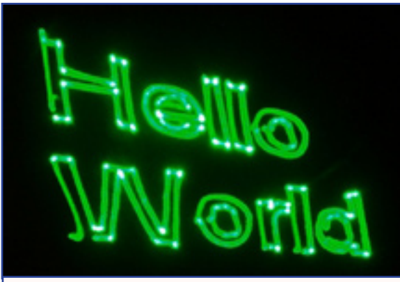
Laser Hello World

“ The Signal ,” which debuted on May 31, discusses digital stewardship in a way that is informative and appealing.